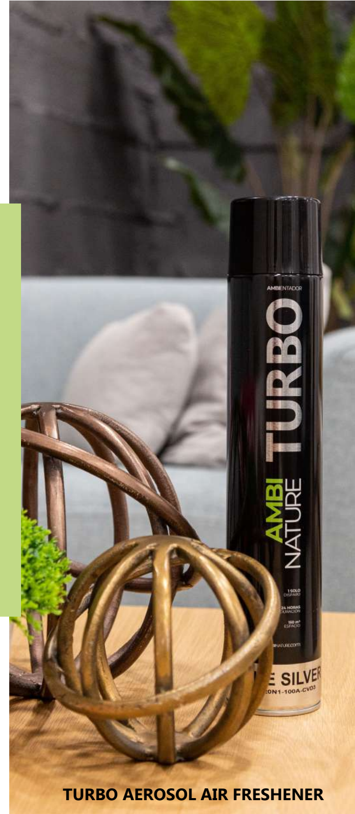
TURBO AEROSOL AIR FRESHENER

GUARANTEED QUALITY Internationally renowned partners