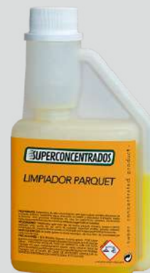
PARQUET FLOOR CLEANER