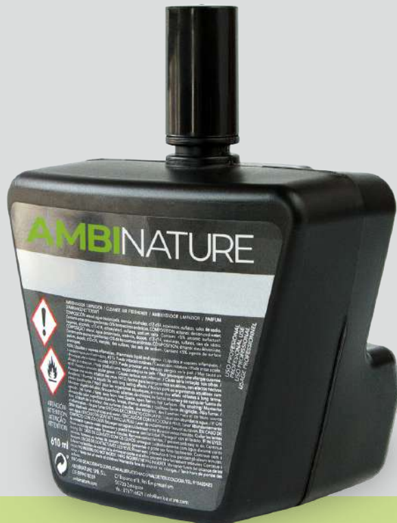
AMBICLEANER AMBINATURE 610ML