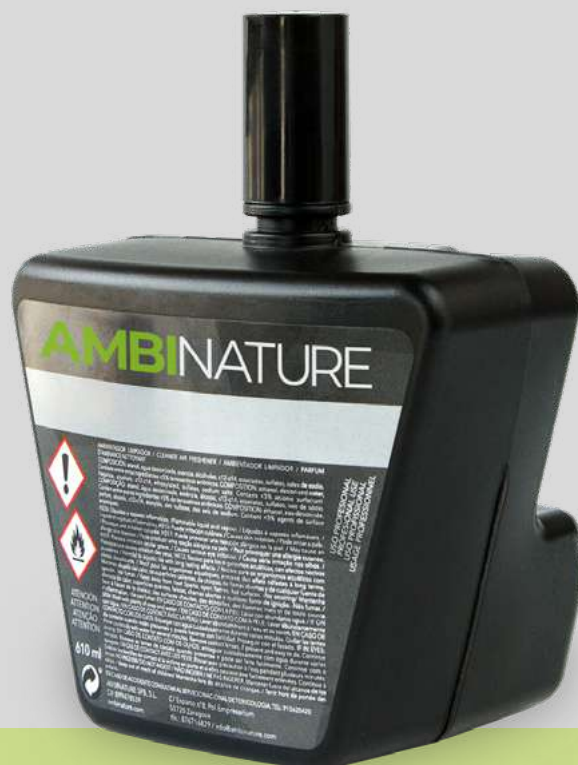
AMBICLEANER NEW 610ML