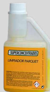
PARQUET FLOOR CLEANER